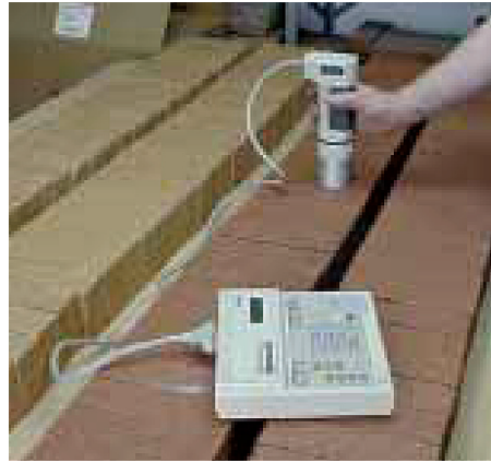
Figure 3: Color Room Layout