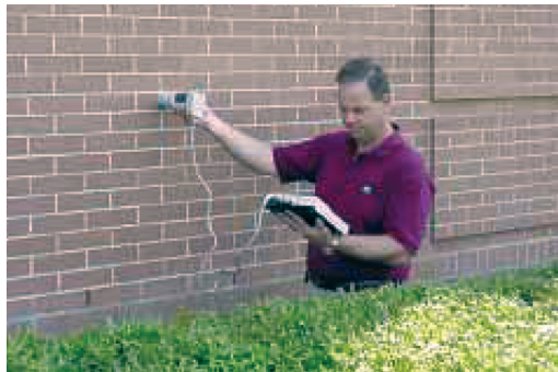
Figure 7: Collecting Data for a Match Job