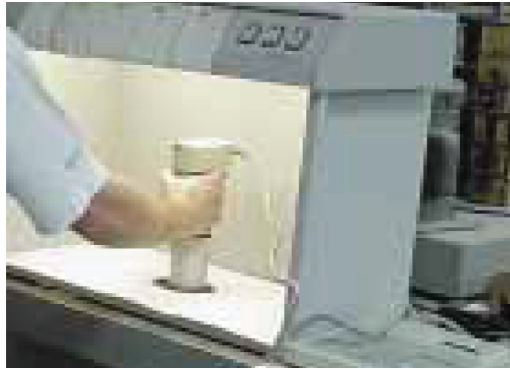
Figure 6: Color Check of a Red Iron Oxide

The NBRC has used color measurement in both research projects and field complaints. In the study of capture (body) additives to possibly reduce emissions, the maximum addition rates of the additives were established based on color. Decisions could then be made as to whether the additive might be effective without changing the color. Body additions of fluxes, bottom ash, fly ash, etc., can