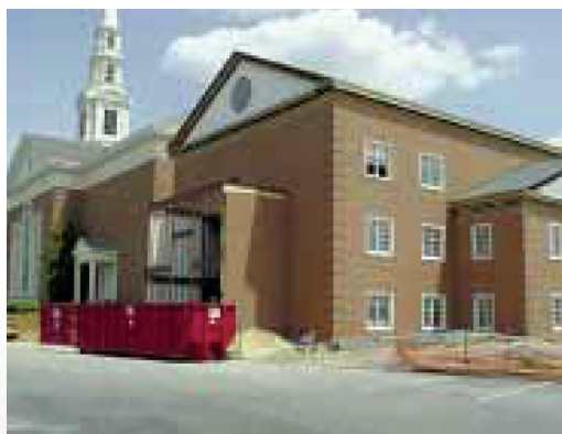
Figure 8: The Completed Addition with Successful Color Match

be evaluated in the same way. Also, the addition of recycled process water or effluent water can be tested for effect on color. Color monitoring in these cases can establish standards which can help solve environmental problems without sacrificing product quality and integrity.