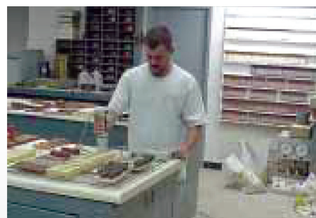
Figure 5: Quality Control of Raw Material Figure 3: Color Room Layout (Note: Master Display Rack in Background)

reject incoming shipments. This procedure has greatly reduced the testing time necessary to evaluate these materials.