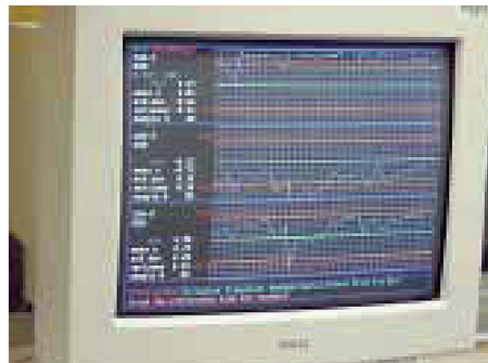
Figure 4: Daily Report on Color